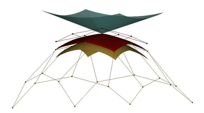
Figure 2: The original surface (below) and the interpolating linear blending surface. The permissible positions of the upmost control point is shown by a volume bounded by a cone-like surface.

Summarizing the above results one can see that the permissible positions of \mathbf{v}_{i,j} is a volume bounded by a cone-like surface the apex of which is the given point \mathbf{p}_{i,j} and its base is composed of the four boundary curves of the envelope surface (4.1) (see Fig.2).